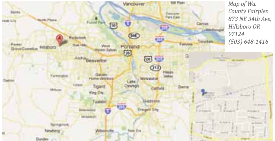
Map of Wa. County Fairplex 873 NE 34th Ave, Hillsboro OR 97124 (503) 648-1416