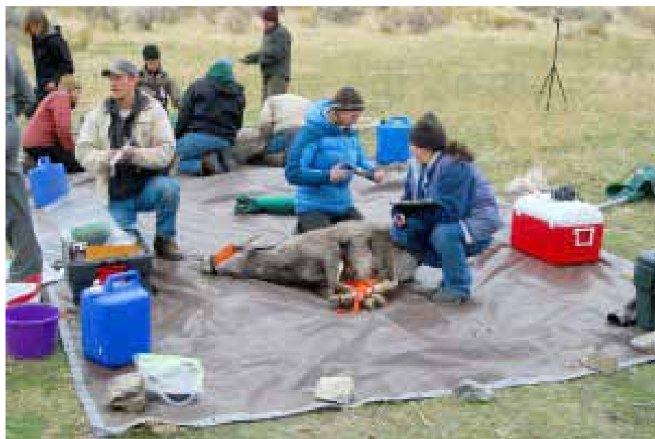
ODFW relocates a dozen bighorn sheep to Jim Creek drainage