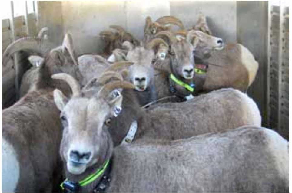
Sheep in transport to Jim Creek drainage.

“Wild sheep are notoriously susceptible to domestic sheep diseases. Many of these diseases don't affect the domestics much, but can really hammer their wild